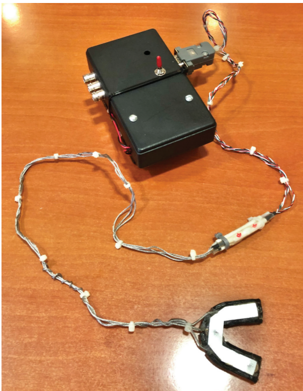
Figure 1. The dental apparatus of the bite force recorder device, designed to be suitable for the incisor and molar tooth sections, and the unit that amplifies the bite force data are shown

The visual analog scale (VAS) was used to rate the pain. Using the faces pain rating scale, the patients were instructed to point to the position on the line between the faces to indicate how much