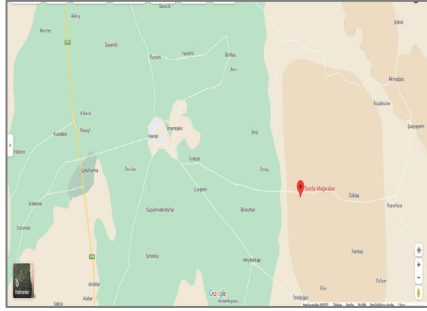
Figure 2. Harran Map Source: 14.04.2022 Google Map

Here, the cultivation of crops and the domestication of animals first came into practice, and the first connections between religion and architecture were formed. The city was once populated by the Sabians , a community of star worshippers, and became a vital trading post in the ancient world. Its geographical location provides an outstanding view of the constellation Orion. The world's first observatory and university were constructed here, of which the great archway still stands today. Much later, in the 9th century AD, Harran was the leading city for the production of celestial globes in the Arab world. (2).