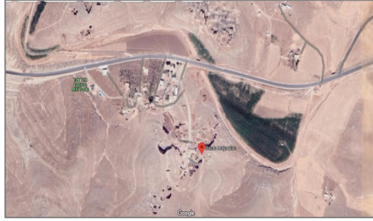
Figure 3. Bazda Map