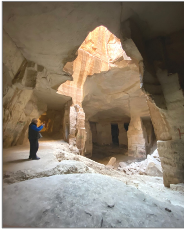
Figure 5. Bazda Cave

It is estimated that Bazda Caves were built in the Roman period. From the Arabic inscriptions written on the rocks it is indicated that the stone quarry was operated by Abdurrahman al-Hakkari, Muhammet İbn-i Bakır and Muhammed el-Uzzar during the 13th century and also indicated that historical places such as the Harran Walls, Shuayip Ancient City and Han el-Barur Caravanserai in the vicinity were built with stones taken from the cave. (Figure 5) Many squares, tunnels and galleries were formed in the caves as a result of stone removal for hundreds of years, while some caves are seen to have three floors (Önal, 2019).