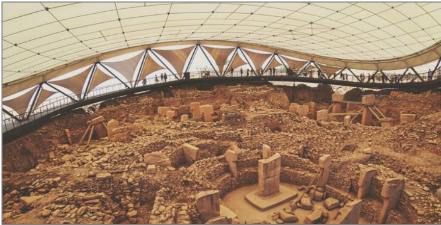
Figure 1. From Göbeklitepe

Located roughly 20 kilometers from Turkey's present-day border with Syria in Upper-Mesopotamia, Harran lies at the heart of where mankind first settled down. Archaeological remains — such as those at the nearby site of Göbekli Tepe— demonstrate the earliest signs of civilization as we know it (Figure 1).