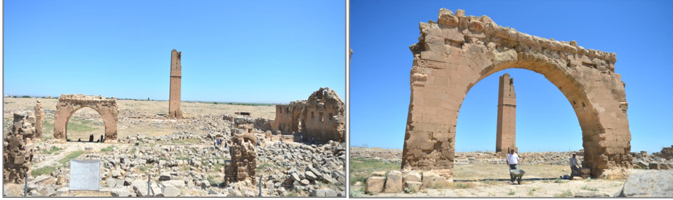
Figure 4. First "university" education institution